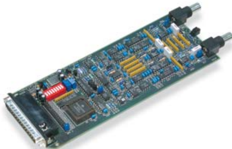
The 2-channel DBK4 provides systems with the ability to accept dynamic signal sources

The 2-channel DBK4™ dynamic signal-input card enables IOtech's data acquisition systems to accommodate inputs from piezoelectric transducers, such as accelerometers or microphones, as well as from various other dynamic signal sources. Each DBK4 card is equipped with two BNC connectors and footprints for two user-installed Microdot™ connectors, permitting it to easily accommodate most transducer connections. Up to 128 cards can be attached to one system for a total of 256 dynamic signal inputs.